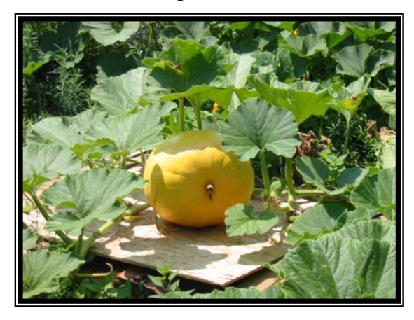
The pumpkins were already large in July

Late summer is a great time to be on the farm. Fresh produce greets you upon returning from a weekend in the sun. The schoolhouse garden project is moving along quite well. The first cob of corn was picked in mid summer and tomatoes are coming on strong. The plums in the orchard on the farm were ready in early August and apples and pears are not far behind. There will be plenty to see and taste when the students return in September.